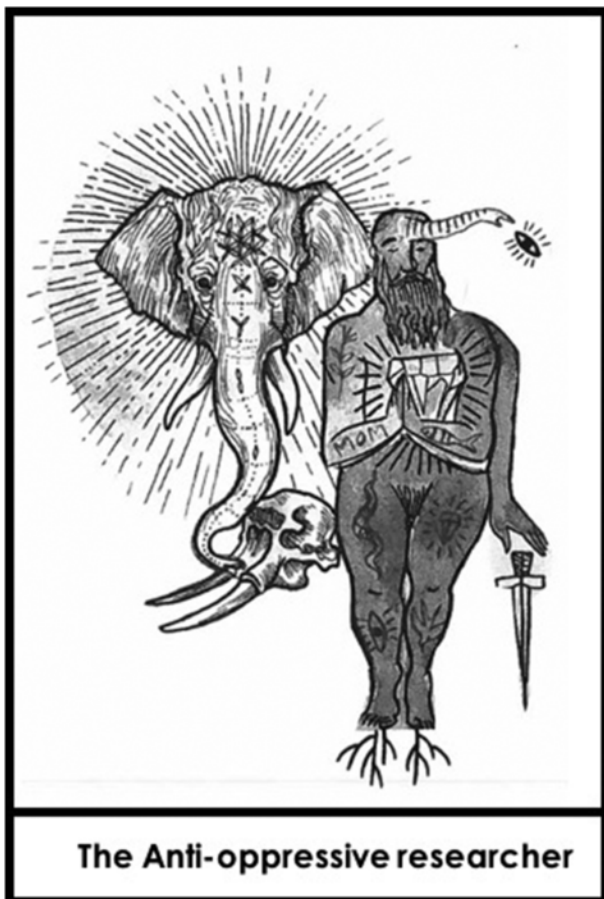
Fig. 5. The anti-oppressive researcher.

The co-conspirer works to help regenerate and reproduce the collectively imagined and desired emancipation of those she is working with. She takes careful and incremental ontological steps with the collective to build creative and revolutionary praxis. She sees imagination as a key tool in shifting dominant hegemonic discourse (Smith, 1999: 39) as she understands re-imagining processes as not just a re-thinking of how one sees the world; but expanding our way of being by opening ourselves up to alternatives and bringing these alternatives to life through our writing, our art making and our performance.