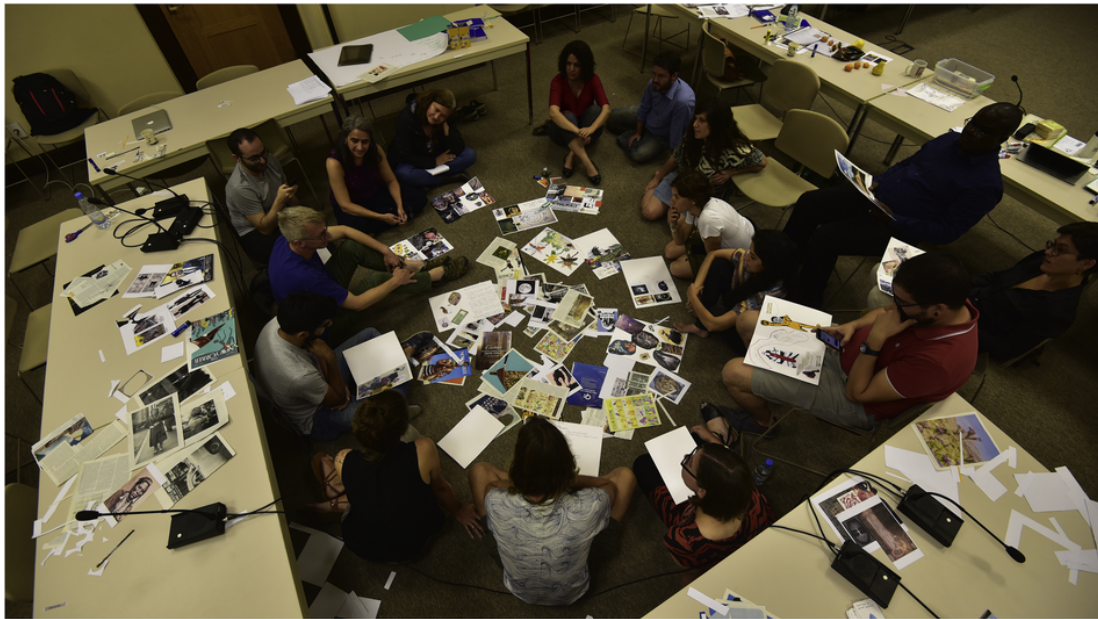
Fig. 2. The arts-based Tarot exercise.