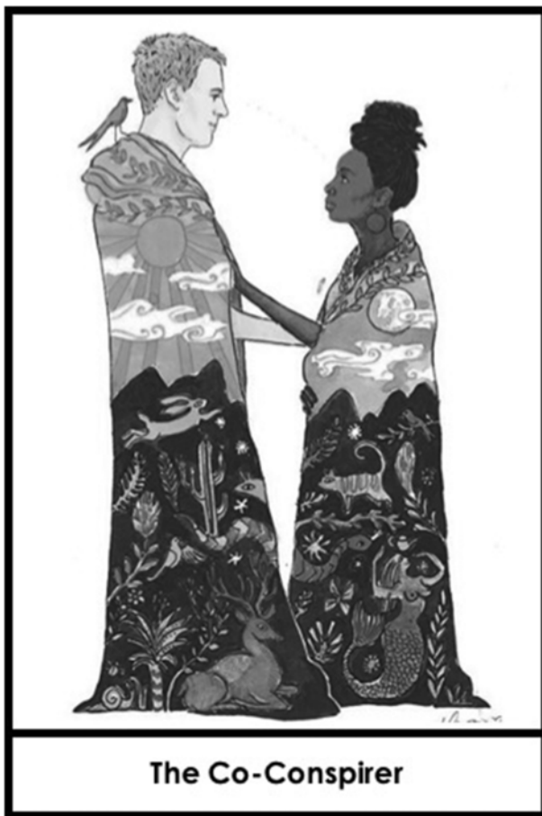
Fig. 6. The co-conspirer.

In particular, the co-conspirer raises concerns over the discarding of human embodiment of the environmental imaginary and she encourages an embodied ecological citizenship, that attends sufficiently to body, place, and politics, especially as these are understood as different modes of engagement with the world within history (Reid and Taylor, 2000: 440). Like the trickster, personified as the jackal in many African stories, she is able to move between worlds with ease, in this case the existing hardened socio-economic and political histories that we respond to daily, while maintaining a deeply connected and sensorial relationship with the wider natural ecology. She responds to the cultural and political “body-blindness” we see in technocratic environmental responses connected with the disparagement of local knowledge and personal forms of knowing and capacities not only in the policy system, but also in education and even in the larger environmental movement (McGarry, 2013). The co-conspirer challenges body-blind, non-dualistic understandings of the individual within a matrix and subject/object dualisms, and connects this to democratic freedom (Reid and Taylor, 2003).