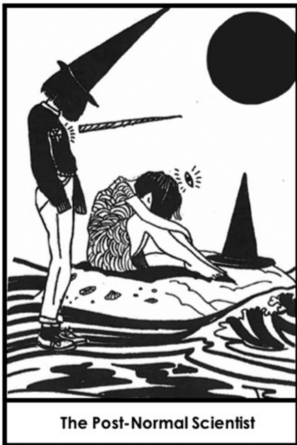
Fig. 3. The post-normal scientist.

may contribute to putting in place the transformation they would like to see in the world.