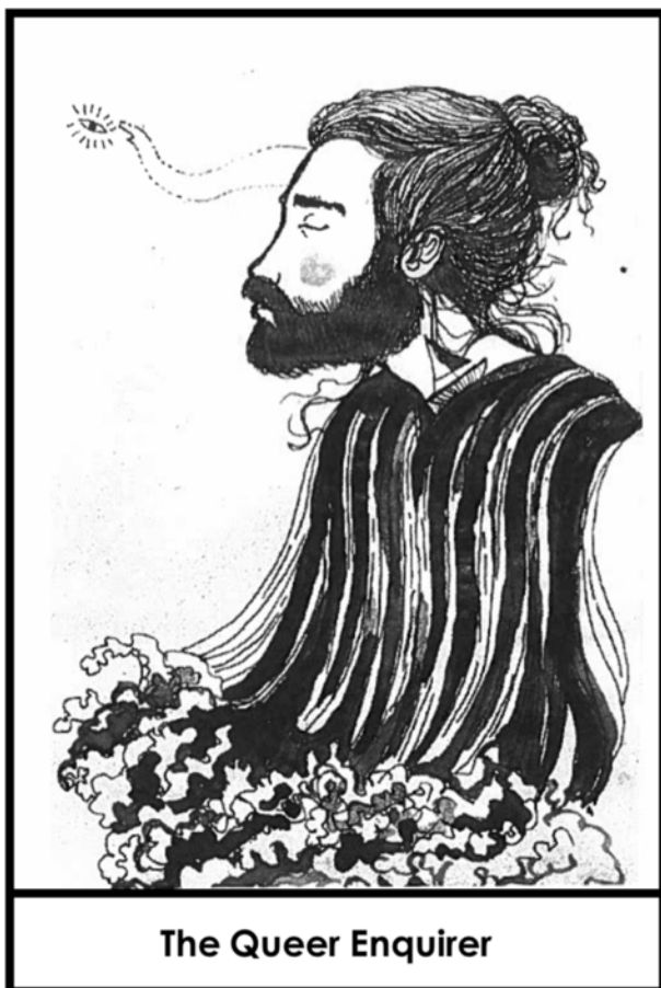
Fig. 9. The Queer Enquirer.

Care means accepting and embracing failure, it entails guarding against self-exploitation of care work and strategies to respond to the dictates of academic orthodoxy and success. It can mean a process and