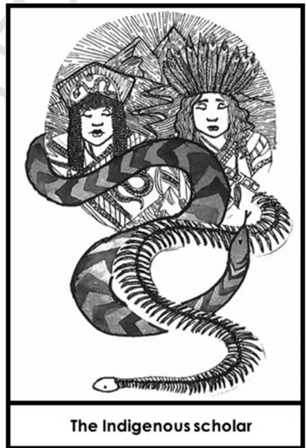
Fig. 4. The indigenous scholar.

As Smith (1999) explains in Decolonizing Methodologies , traditional research on Indigenous peoples, or “research through imperial eyes”, marginalises the stories of the Other within a claim of universal