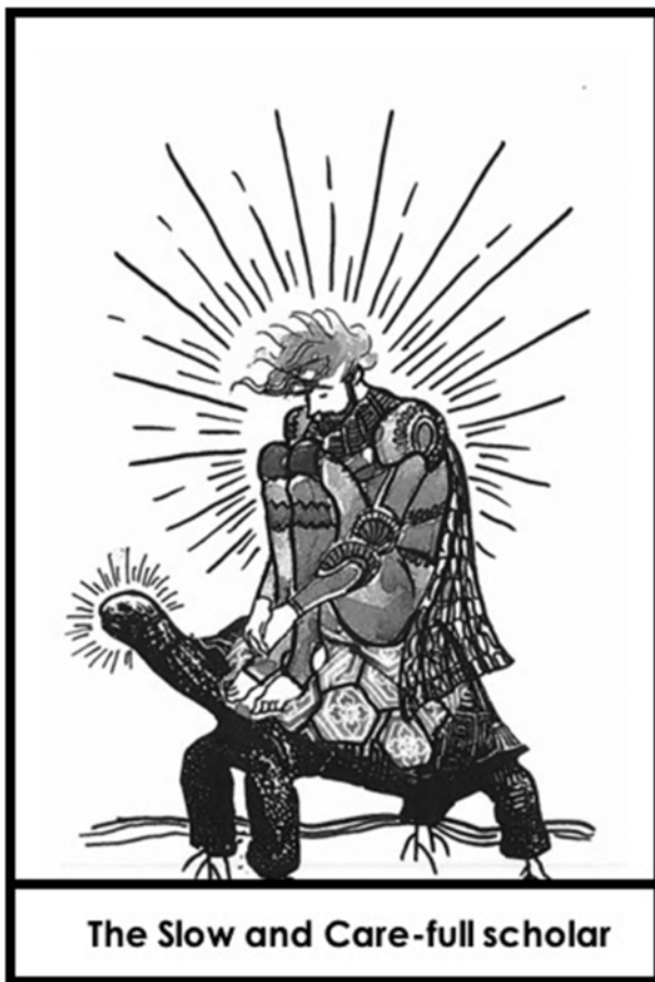
Fig. 10. The slow and care-full scholar.