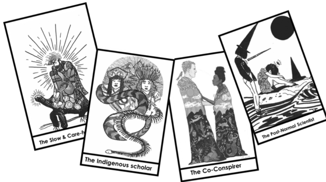
Fig. 1. The Tarot deck of transgressive research.

solved by purely scientific-rational approaches.) that are in a constant state of flux; as well as what is emerging from our research community: we see our peers grappling with similar struggles and having to navigate these issues in a similar way, and so this paper has emerged as a way to acknowledge these struggles and open up communal reflexivity.