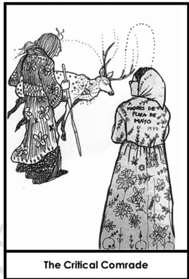
Fig. 8. The critical comrade.

The critical comrade is a character that allows us to think through and deal with both the synergies and potential tensions that may arise when juggling the dual roles of movement activist and professional academic/researcher. The critical comrade is committed to help generate knowledge which would be useful to social movements from below, however she acknowledges that while the collaborations between scholars and activists can be immensely fruitful, they can also be knotty and problematic and loyalties to both aims may conflict as there